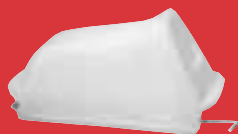
4 Gallon Tank (Available in Eight (8) Different Colors)