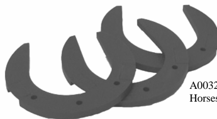
A0032-1P -- Optional 25# Horseshoe Weights (each)

Hawk Enterprises, Inc. 52744 Park Six Court Elkhart, IN 46514 (888) 289-4295 Phone (574) 294-1910 Phone (866) 429-5329 Fax (574) 970-0289 Fax