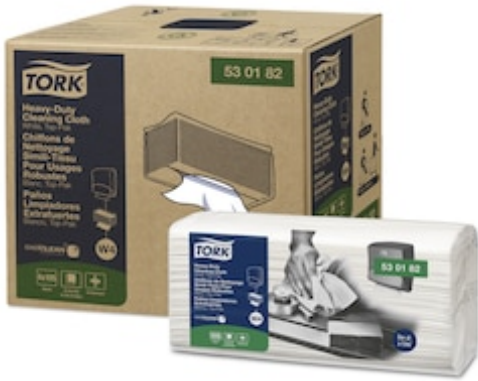
Tork Heavy-Duty Cleaning Cloth Folded W4 530182