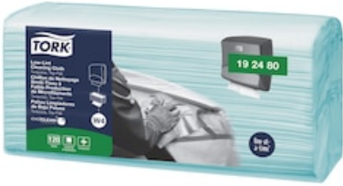
LOW-LINT CLNG CLOTH TURQ TPAK 4 /120 192480