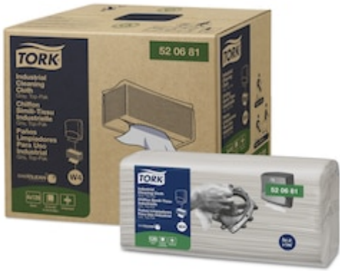
Tork Ind Cleaning Cloth Grey Folded W4 520681