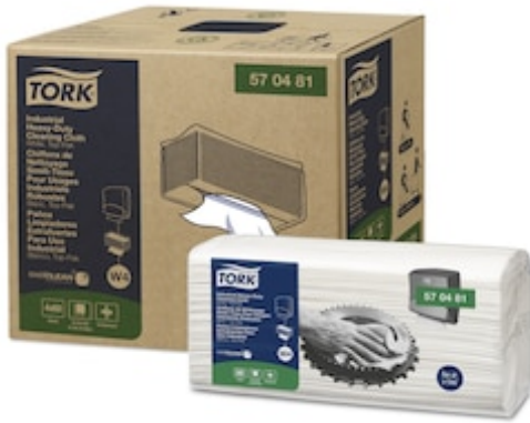
Tork Ind Heavy Cleaning Cloth Folded W4 570481